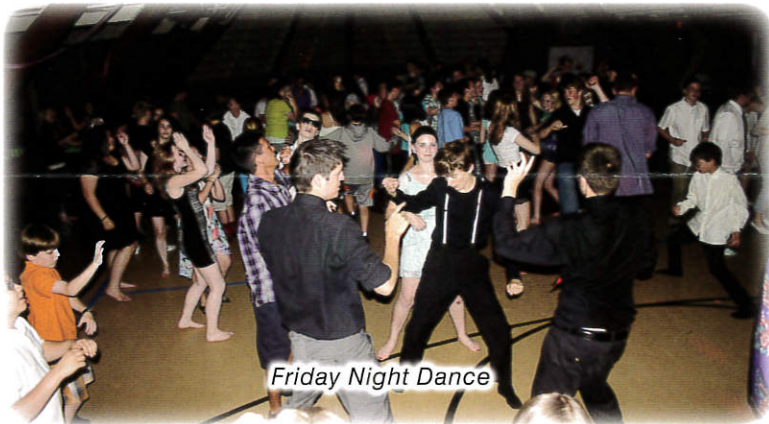
Friday Night Dance