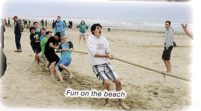
Fun on the beach