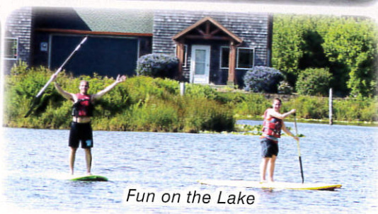
Fun on the Lake