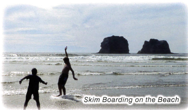
Skim Boarding on the Beach