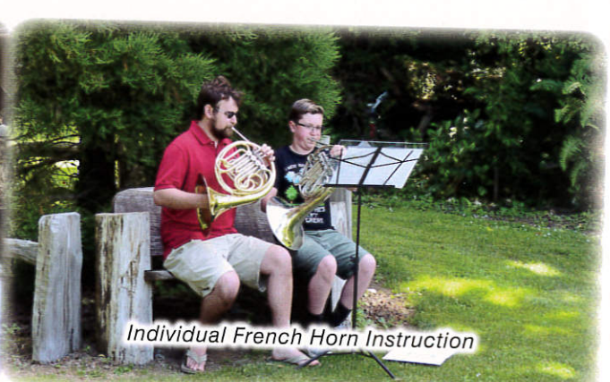
Individual French Horn Instruction