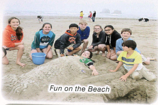
Fun on the Beach