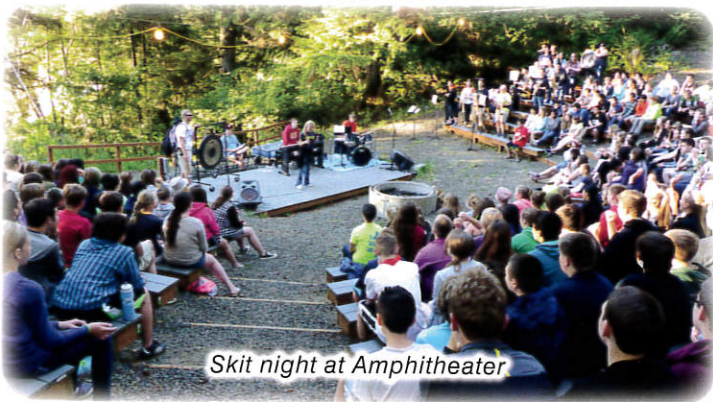
Skit night at Amphitheater