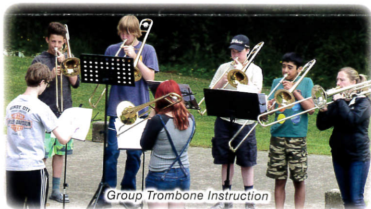
Group Trombone Instruction