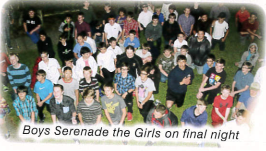
Boys Serenade the Girls on final night