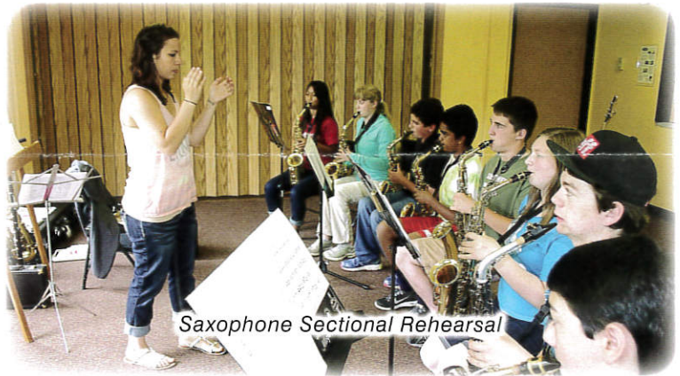
Saxophone Sectional Rehearsal