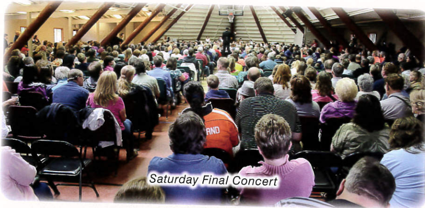
Saturday Final Concert