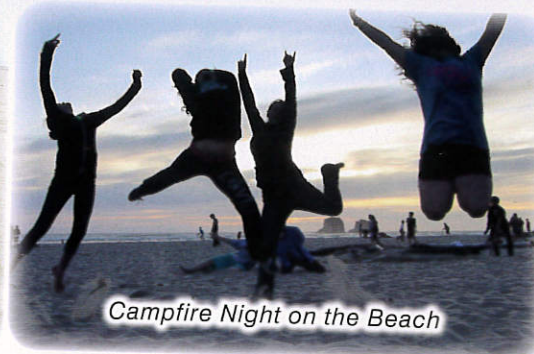
Campfire Night on the Beach