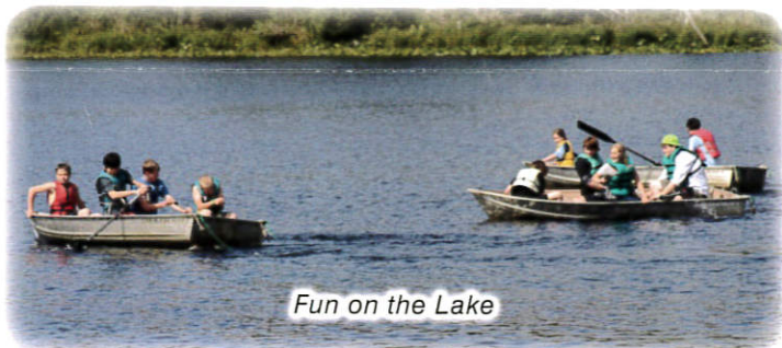
Fun on the Lake