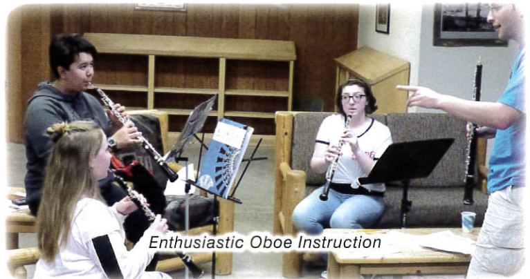
Enthusiastic Oboe Instruction